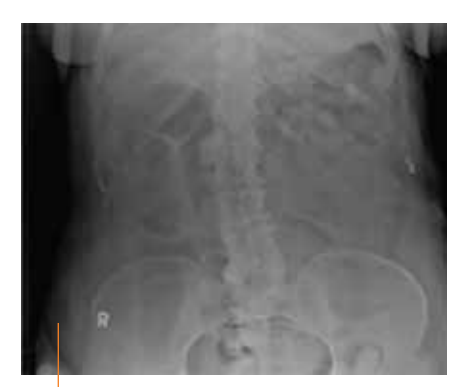
Cadaver abdomen imaged with no scatter correction.

Many physical factors affect the properties of scatter, including the energy spectrum of the beam, the thickness/size of the object and collimation. Using empirical modeling, SmartGrid accommodates these factors via algorithm parameters which are tuned to approximate anti-scatter grid visual performance.