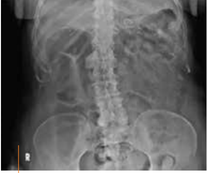
Same view processed with a conventional anti-scatter grid.