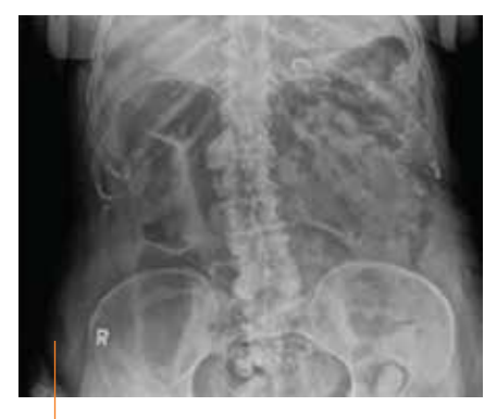
Same view processed with Carestream's SmartGrid Software.